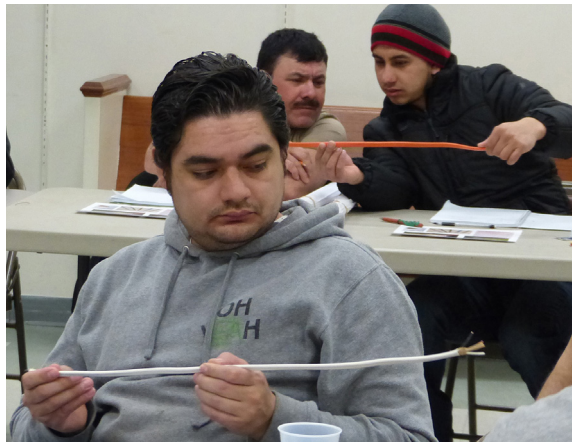
Lesson in electrical wiring