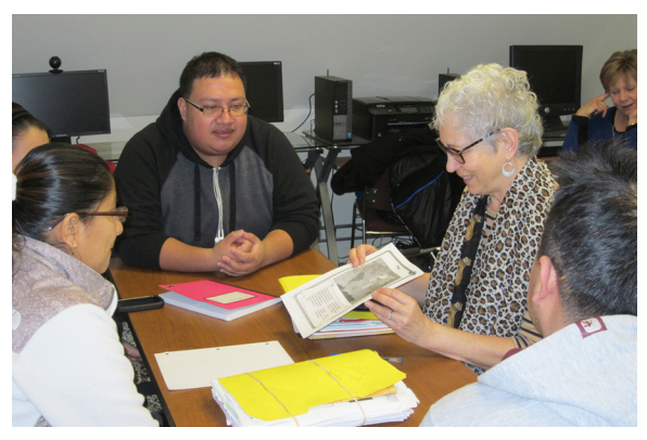
English language class