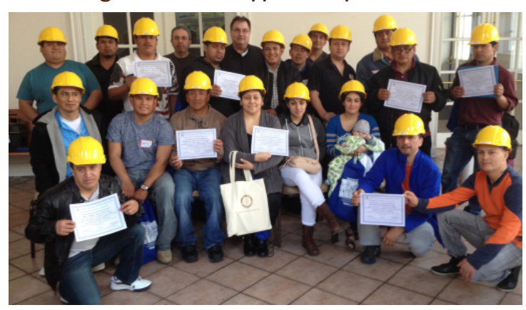
Basic Construction Skills class / OSHA training