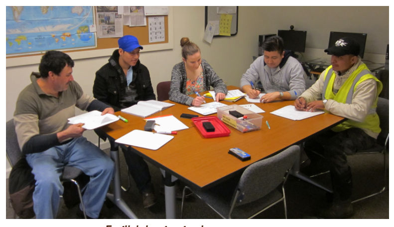
English language class