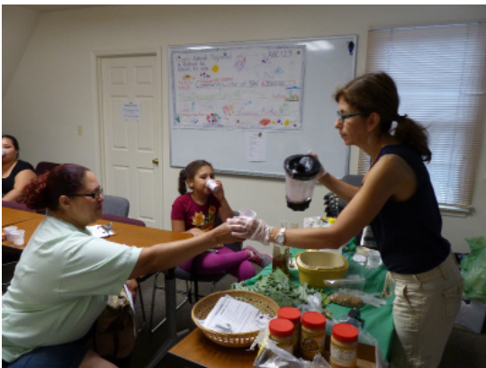
Lesson in nutrition

“This is an excellent opportunity to learn what is needed in our daily work.” ~ JN