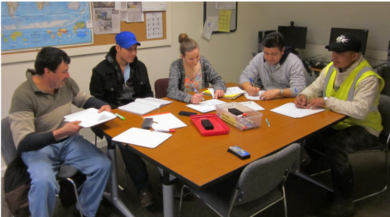
English language class