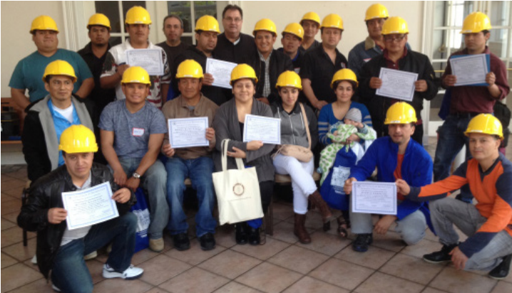
Basic Construction Skills class / OSHA training