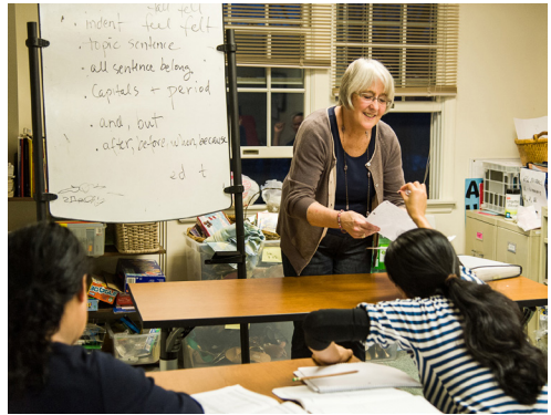
Advanced English Class